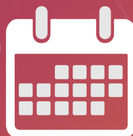
Youth Marketing Activity