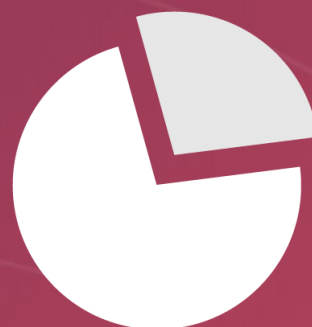
Candidate Attraction Rate